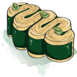
Pistachio cream and praline

A cross between a brioche and a croissant