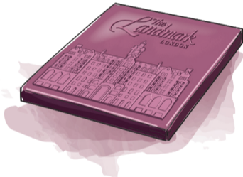
Landmark Chocolate Bar Raspberry chocolate with candied salted pistachio