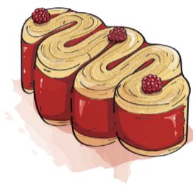
Vanilla custard and redcurrant preserve