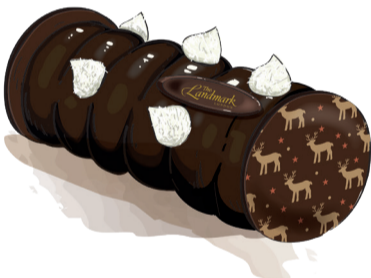
Seasonal Yule Log Valrhona chocolate, hazelnut financier, mandarin and yuzu (pre-order only)