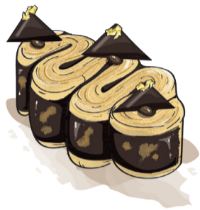
Christmas pudding, Valrhona chocolate and hazelnut ganache