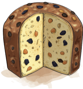
Landmark Panettone Raisins, candied fruit peels, lemon and orange zest (500g)